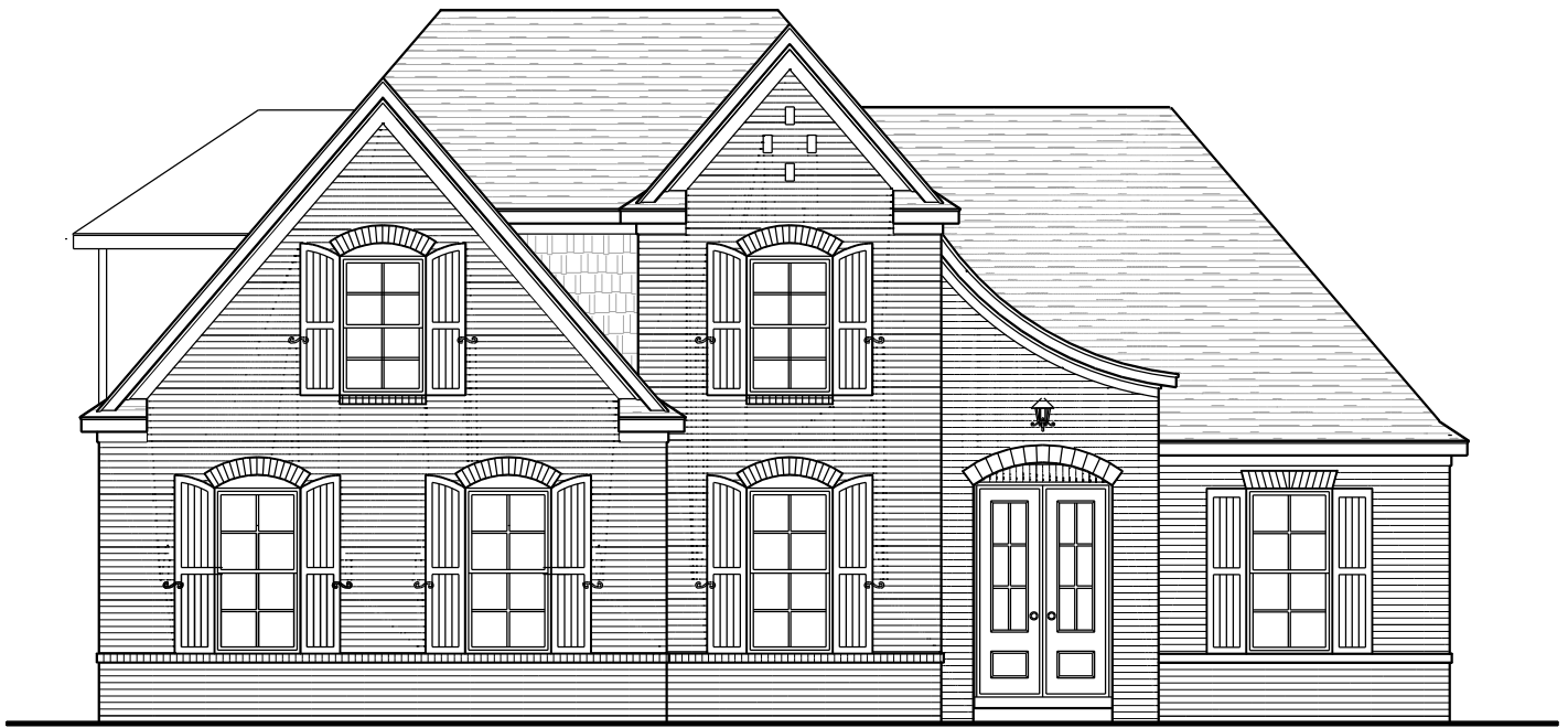
S10-258101-A Revised 2